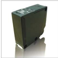
Safety IR beam