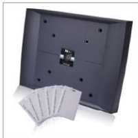
AR200U Mid Range Reader