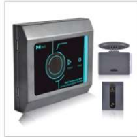
AR500U Long Range Reader